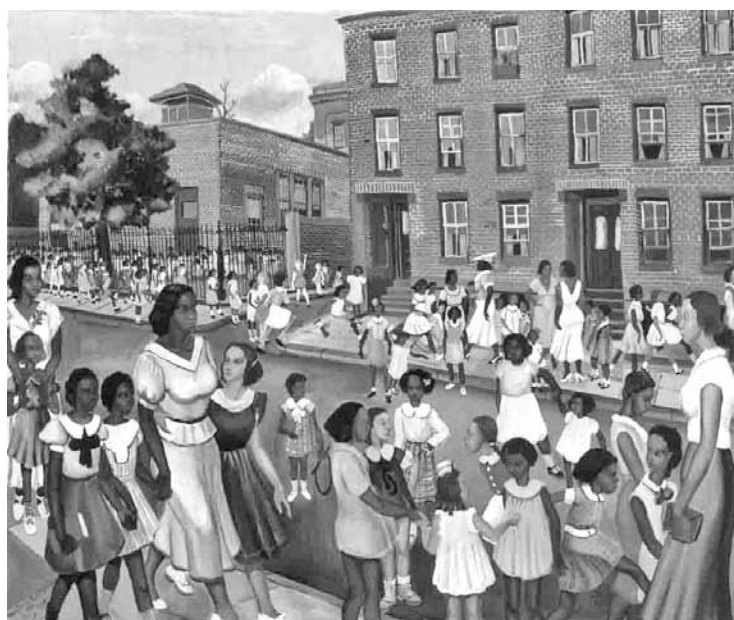
Allan Rohan Crite, School's Out , 1936.