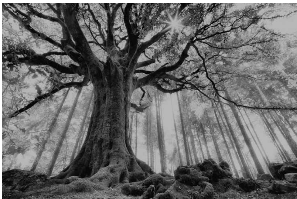
Le légendaire hêtre de Ponthus, dans la forêt de Paimpont (F).

Tasks can be unfocused or focused. Where tasks are intended to facilitate the acquisition of grammar they will need to be focused – that is, they are designed to induce attention to and use of a specific grammatical feature. Such tasks often figure in explicit instruction involving presentation-practice-production (PPP) where they provide a means for the intentional practice of a grammatical feature that has been previously explained to the students. However, in implicit grammar instruction focused tasks serve another purpose. They aim to create contexts for the incidental acquisition of the target feature. Thus, students are not told what the target is. They are encouraged to orientate to the task as a “language user” rather than as a